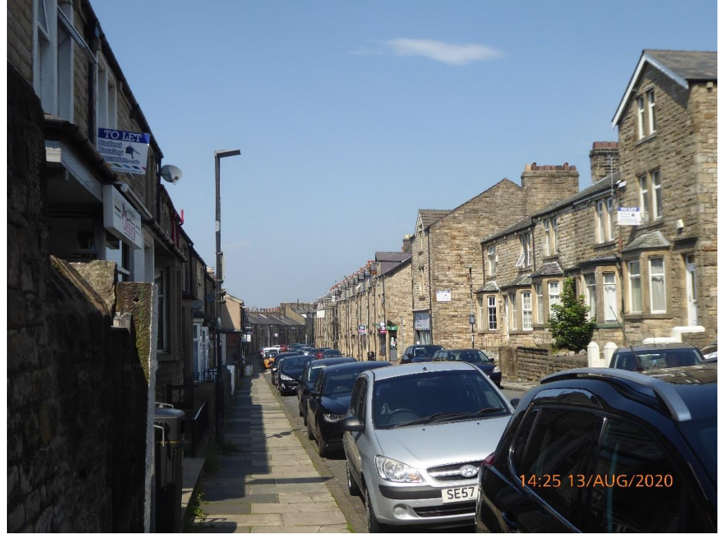
Prospect Road – 8 signs displayed during the summer period