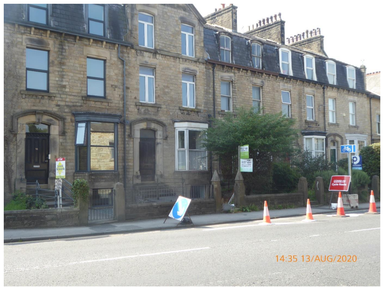
South Road – 4 signs along a short stretch displayed during the summer period