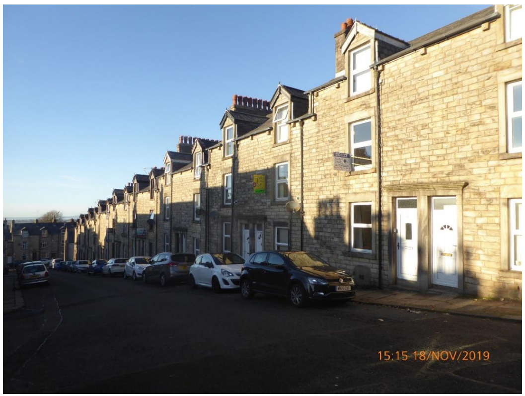
Clarence Street (check)